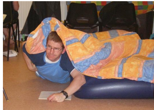
A rather animated play reading of Bedroom Farce in December 2007. More info here (page 5).

A few of us have decided to launch a group for those members who enjoy drama, but perhaps do not want to act, or are just not acting in the current production. If you love to read and have an interest in drama, then this might be for you. The Huntingdon Drama Club Reading group is open to all club members and will meet about monthly. Our first meeting will be Thursday 8 May, venue to be confirmed. We'll look at scripts and have read-throughs in a very informal atmosphere. We'll be able to discuss the characters and the play itself and we might even be able to suggest plays that we think would be suitable for the club to perform in the future.